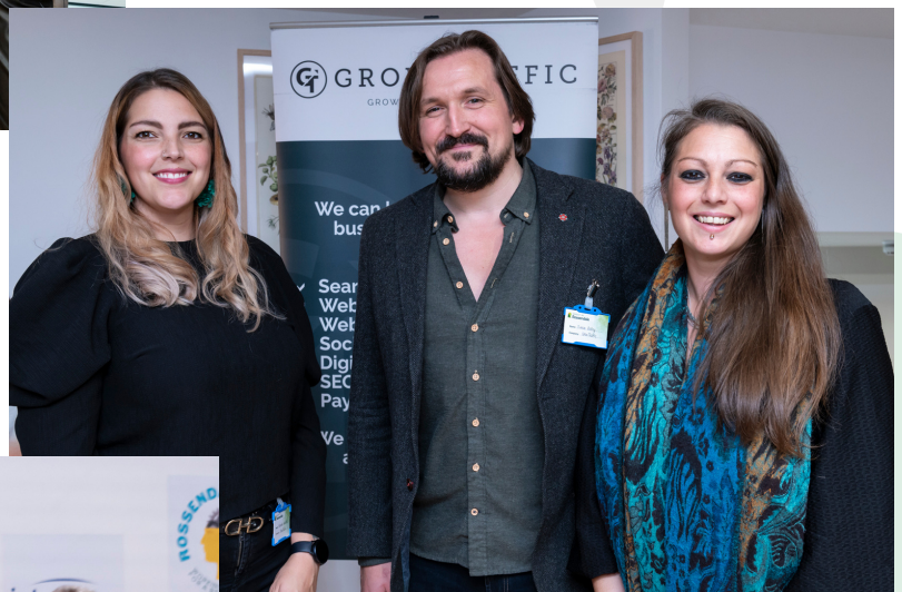
Headline Sponsor- GrowTraffic Ltd