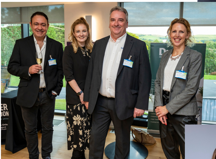
Headline Sponsor- Interfloor Ltd